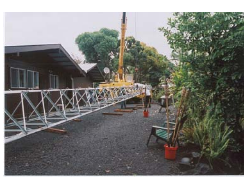
One of Lloyd Cabral's (KH6LC) two new towers ready to be put up