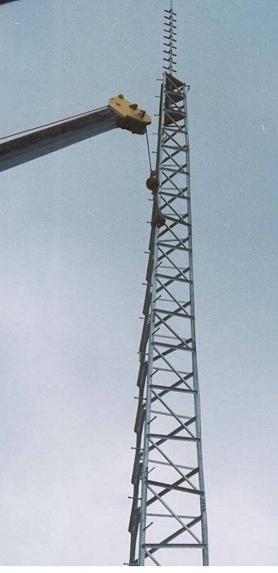
Closeup view of one of Lloyd's towers being lifted by the crane