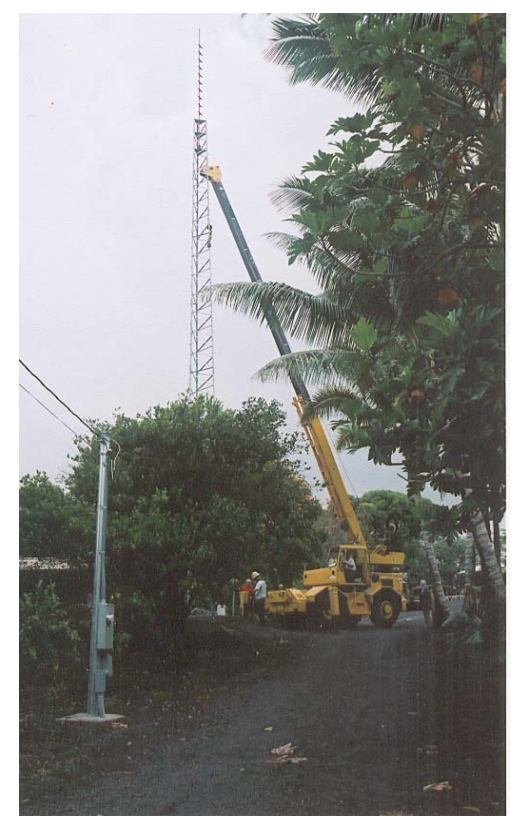
One of the towers being lifted into position by the crane