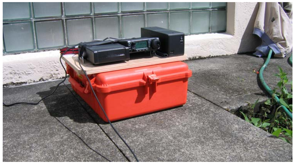
L-R Antenna Tuner, Radio and Power Supply with carrying case.