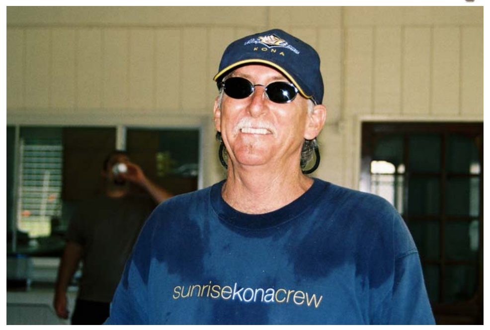
STU KH7DX (Kona ham)