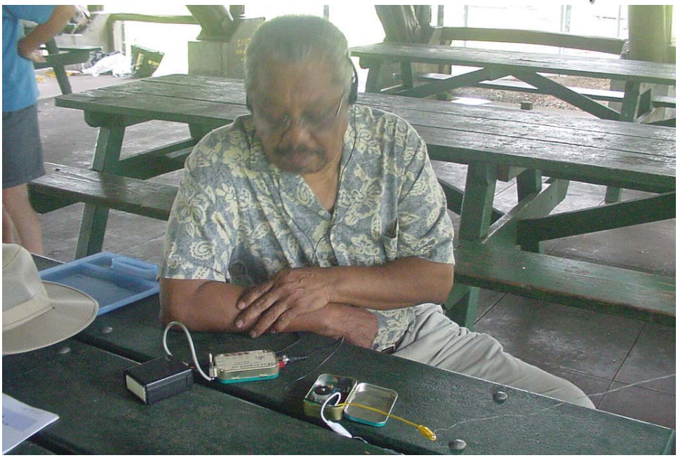
Clarence AH7A and QRP Rig at our September get-together at Wailoa Park