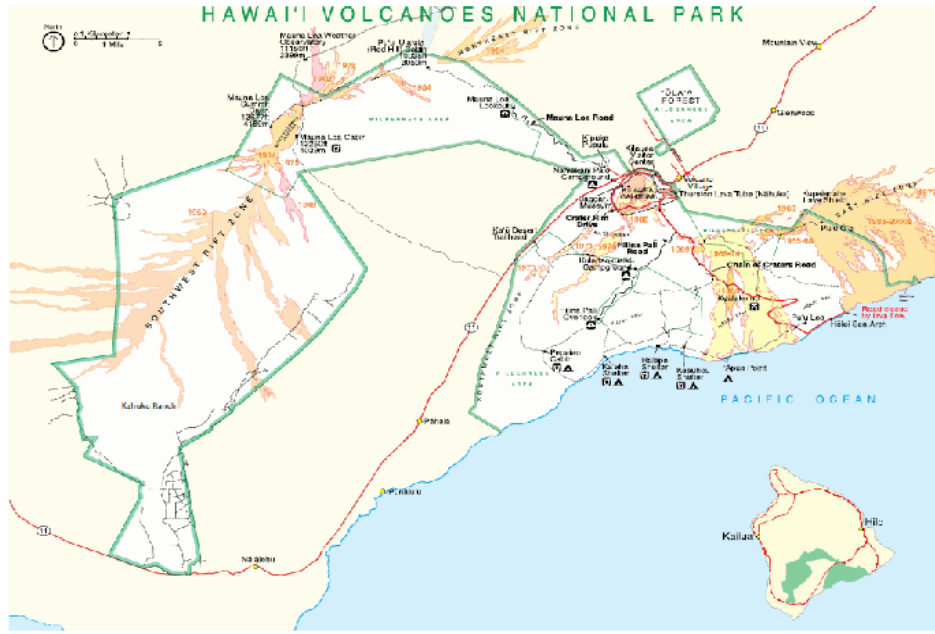
Figure 1. Follow the wiggly road north-west of Kilauea Caldera to the Mauna Loa Lookout (2035M elevation) and the beginning of the trail to the Mauna Loa Summit. Any place in the park, including 'Ola'a Forest counts as the VOL multiplier.