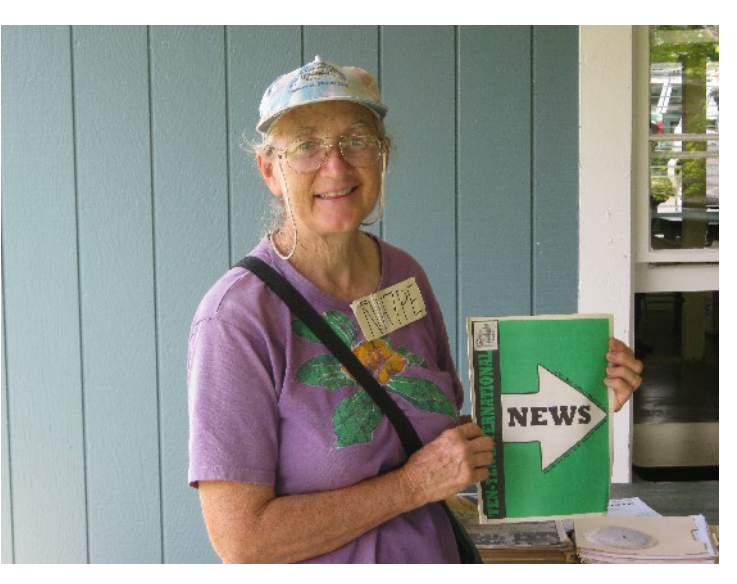
10-10 International Net

We hope everyone will enjoy the 10-10 Spring Digital QSO Party this coming weekend, April 27 and 28. Be sure to check out the net's web site www.ten-ten.org for further information about this event and other upcoming activities. The Spring CW QSO Party will be May 4 and 5, good practice for you CW buffs, and the the Open Season (PSK) QSO Party will be June 1 and 2. There's no excuse for all you scouts to not be prepared.