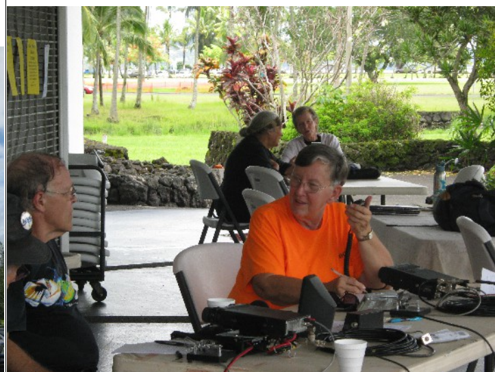
Operations finally underway!