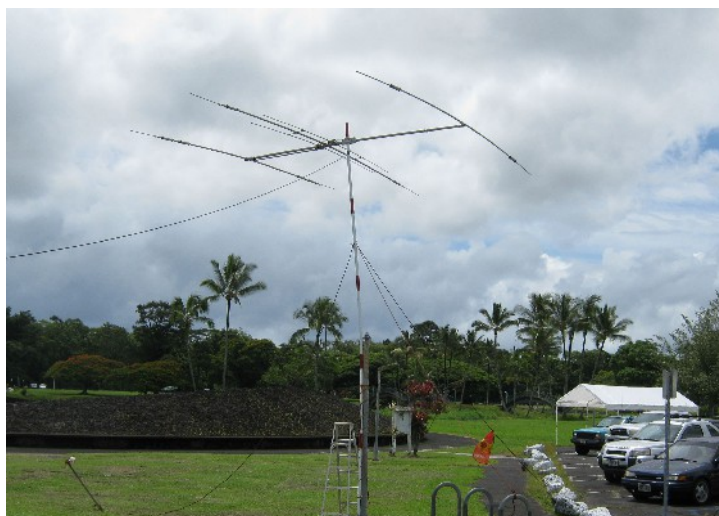
The club's old Yagi (10m reflector missing) in position at Field Day 2013.