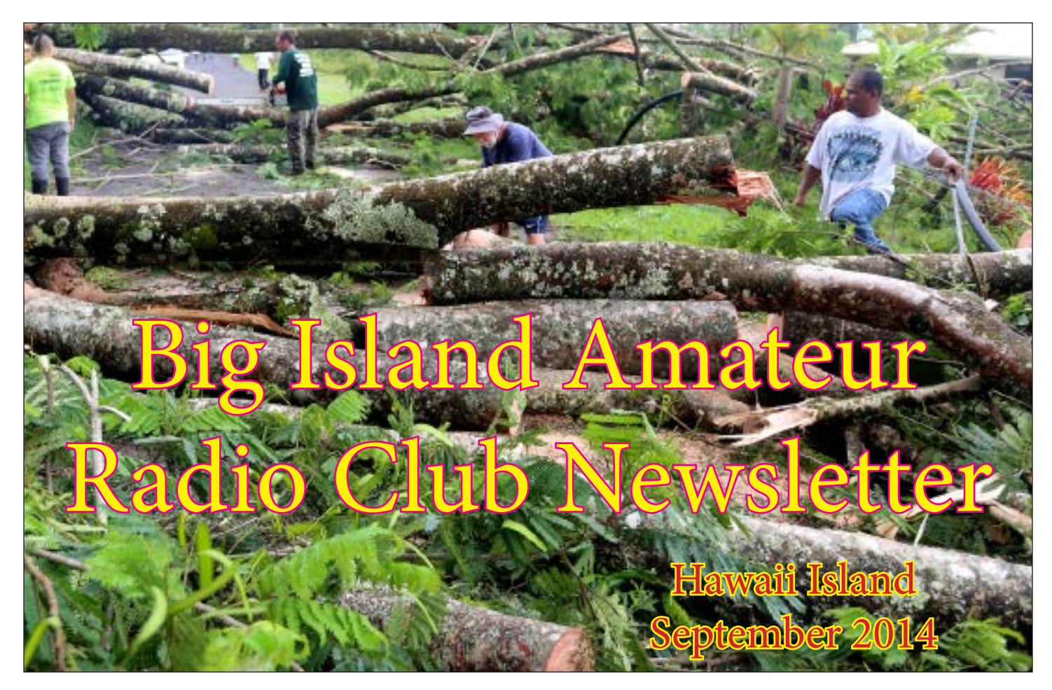
THE MORNING AFTER -- Neighbors help each other clear fallen trees near the intersection of Paradise Road and 15 Road in Hawaiian Paradise Park.

As they do in times of emergency worldwide, amateur radio operators stepped up in early August to provide around-the-clock communications assistance before, during and after Hurricane Iselle arrived in the 50th State.