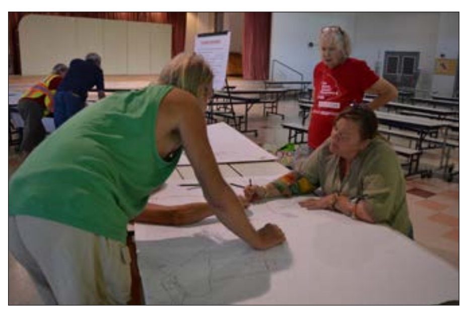
Working on the mapping of neighborhood emergency routes.

AH6J offers encouragement to the next generation of amateur radio operators at the ARRL booth at the Puna PREP Fair.