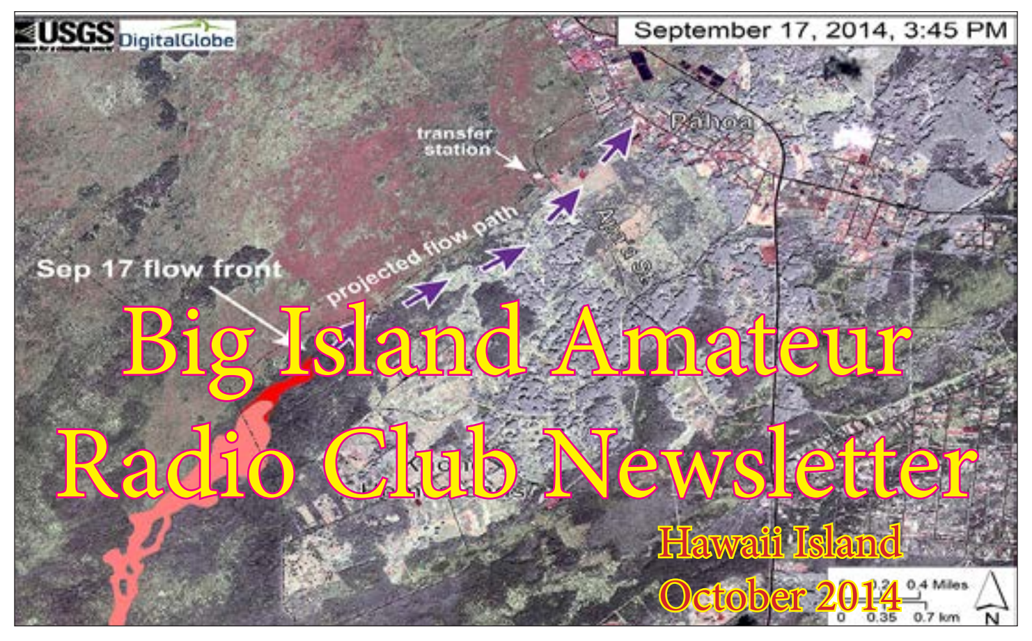
MANY WAYS TO KOKUA -- As was the case before, during and after Tropical Storm Iselle hit the Big Island, there will be plenty to do to keep isle hams hopping as we volunteer in various ways to help the residents of lower Puna now threatened by lava flowing from Kilauea volcano.