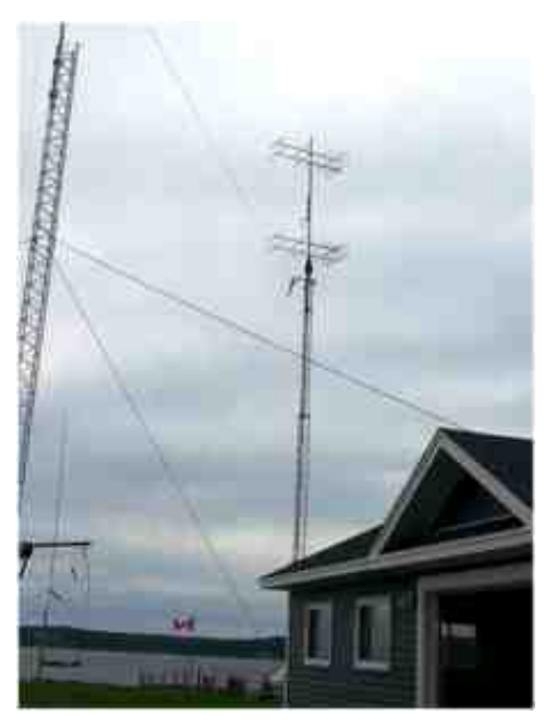
VO1FN in Newfoundland.