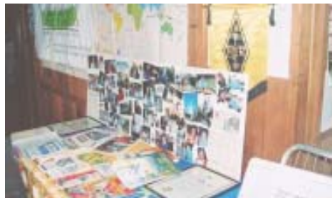
Information Table at Field Day