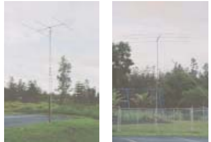
Two of the antennas used on Field Day