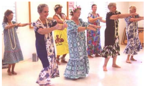
The Pua Kea Halau from Hawaiian Paradise Park