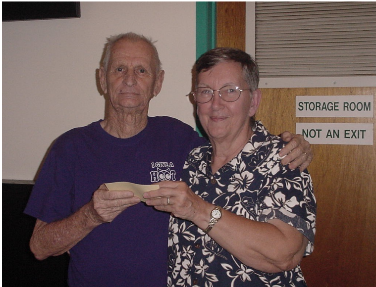
KH7E and NH7FY