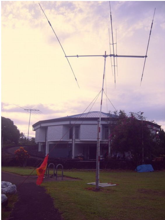
FD 2013

Here is an extract from the BIARC Field Day submission to the ARRL: