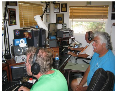
HQP 2012 at KH6LC

Participants will receive a certificate of performance, and plaques will be awarded to top scorers in categories where there was significant competition.