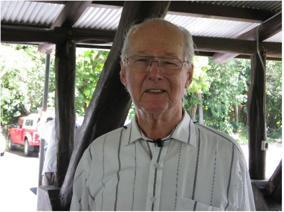
Herb WY6G at Wailoa