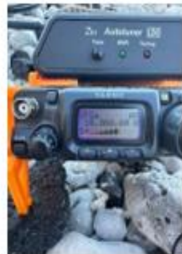
Above: Yaesu FT-817 on the beach Attached tuner - LDG Z817 Autotuner)

Closeup of Bobby's rig in the 3-D printed cage)