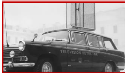
Post-war trolling for illegal TVs.

the group. I know they wanted info on buying the parts and having me print a case, so I'll see if my writeup on the build is still around."