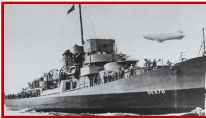
The war years.

The newsletter of the Big Island Amateur Radio Club